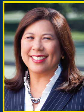
HON. BETTY YEE California State Controller

"I came to the APALF with extensive experience in state and local government and the California Legislature gained from working in senior positions with prominent elected officials. However, despite my more than 20 years of experience and working on numerous campaigns, I felt I lacked practical hands-on political campaign training. APALF helped me become a better prepared candidate to win my election."